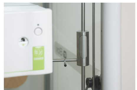
Arm with quick release mechanism for one-hand adjustment.