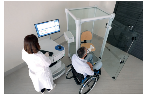
Wheelchair patients can be easily tested outside the cabin.