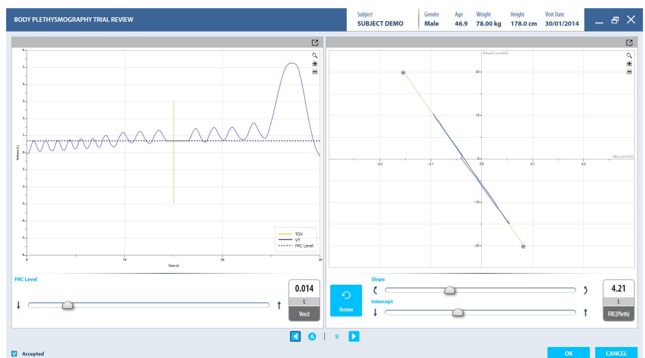
TGV capture edit.