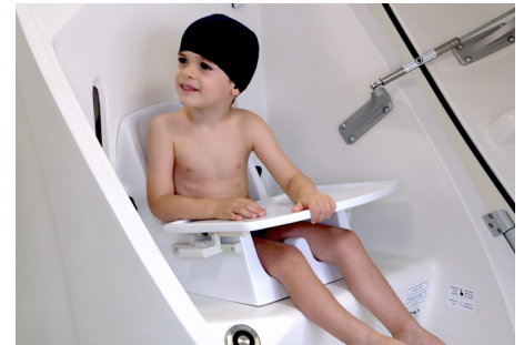
Easy body composition assessment of young children with the Pediatric Option

The BOD POD Pediatric Option allows for body composition assessment of young children between 2 and 6 years old, and as small as 12kg. It includes a customized seat insert to create a safe and comfortable testing environment, and a calibration reference volume.