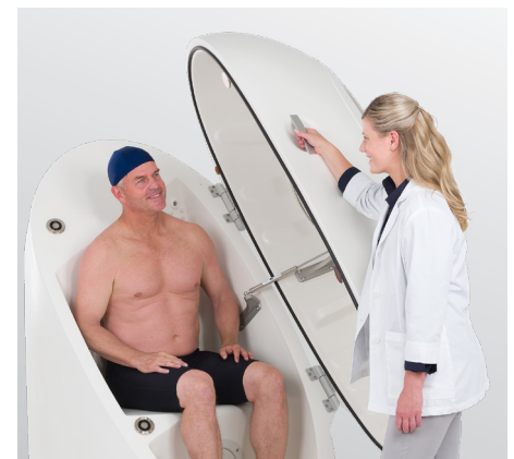
Simple and easy for both subject and operator

Each BOD POD is a complete turnkey system based on the same operating principles as hydrostatic (underwater) weighing, using whole-body densitometry to determine body composition. This technique relies on a mass measurement from the precise electronic scale and a volume measurement from the test chamber. Once body density (Density = Mass/Volume) is determined, the BOD POD measures or predicts Thoracic Gas Volume (TGV) and uses densitometric equations to calculate percent Fat and Fat-Free Mass.